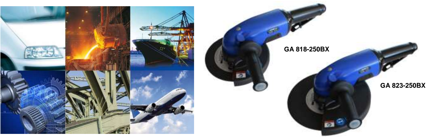
News DEPRAG INDUSTRIAL 7/2016 www.deprag.cz

© DEPRAG. Specifications subject to change without prior notice.